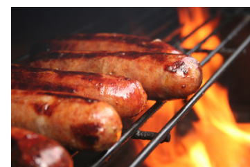
On the Barbecue Freshly caught fish, squid and prawns Spicy chicken Coriander sausages Baked Potato and Corn on the Cob served with fresh salads, Mozambican Peri-peri sauce and Thai NamJim Sauce