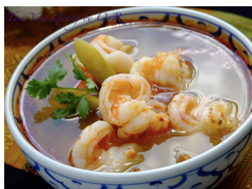
Tom Yum Goong the well known spicy soup with prawns and lemon grass